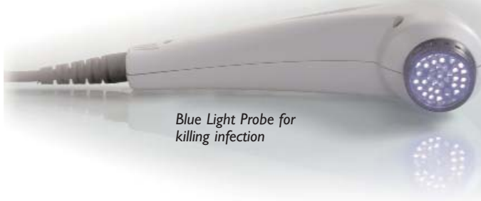
Blue Light Probe for killing infection